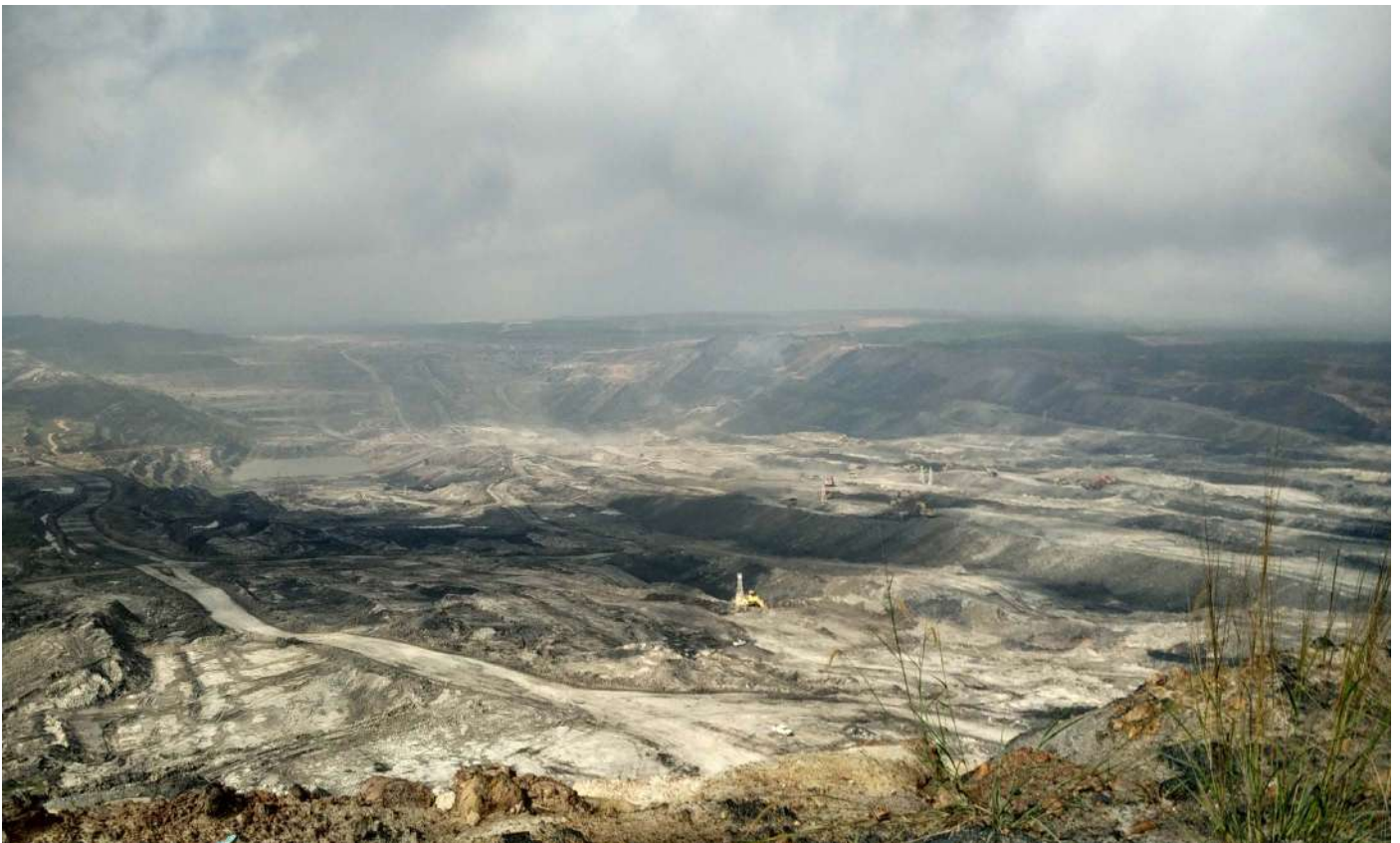
Approximately 43% percent of the surface area of East Kalimantan, an Indonesian province on Borneo, has been handed over to mining companies, according to JATAM, a Jakarta-based coal watchdog.