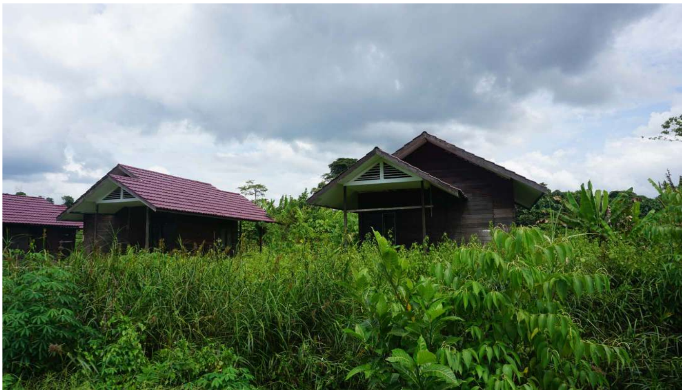
Kaltim Prima Coal built a resettlement site for villagers it seeks to displace. But few residents were able to make ends meet there. The resettlement site is now largely abandoned.