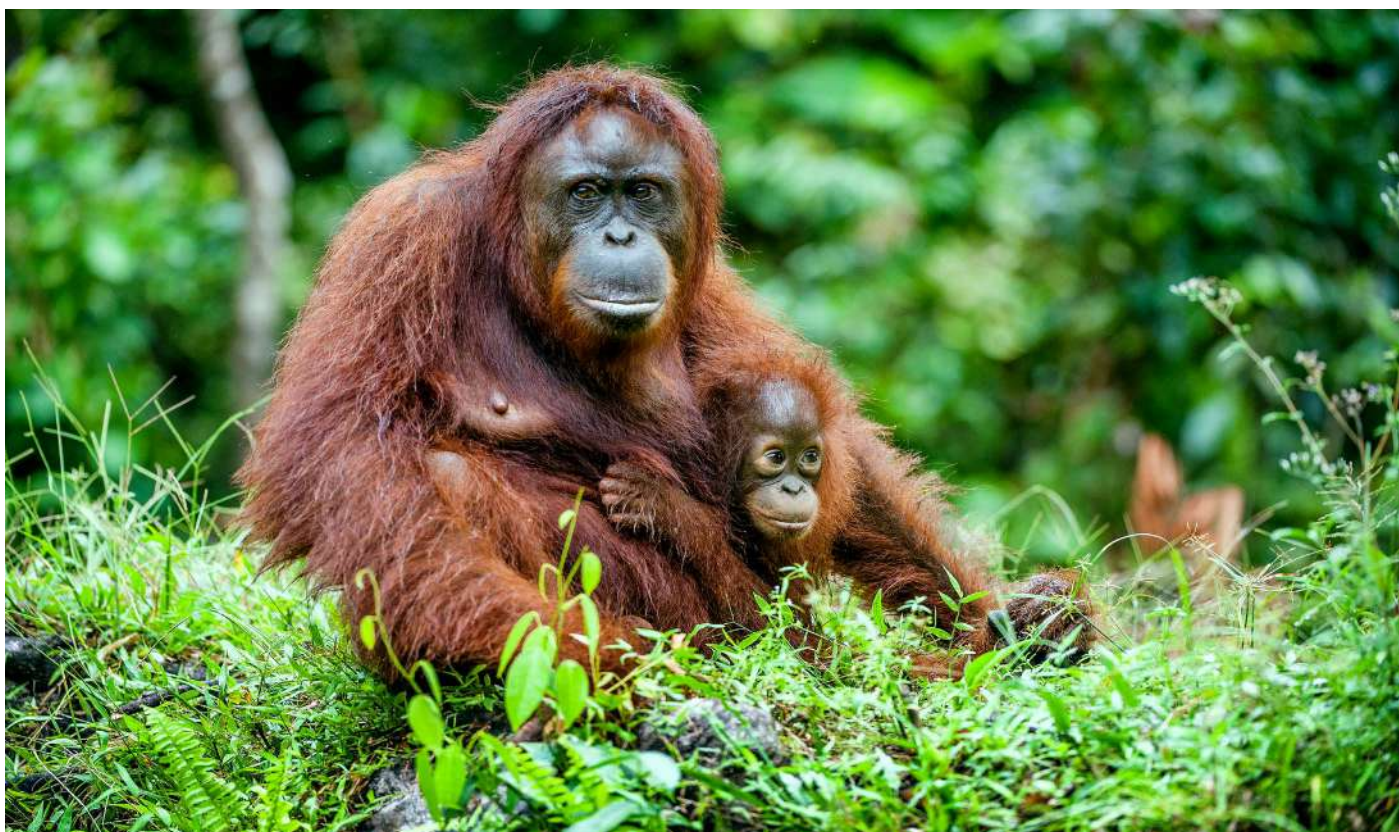
Coal mining threatens Indonesian Borneo's globally important biodiversity, including its endangered population of orangutans.

emitter , ahead of Brazil, according to European Commission data.