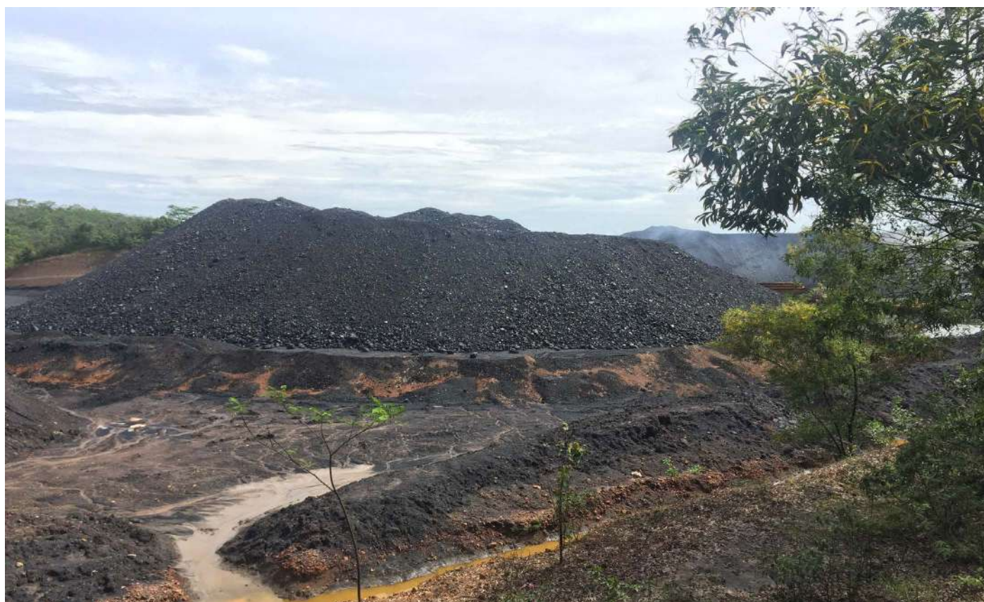
The IFC recently announced new policies designed to cut off its support for coal. Civil society groups have welcomed the move but say the policies are only as effective as their implementation.