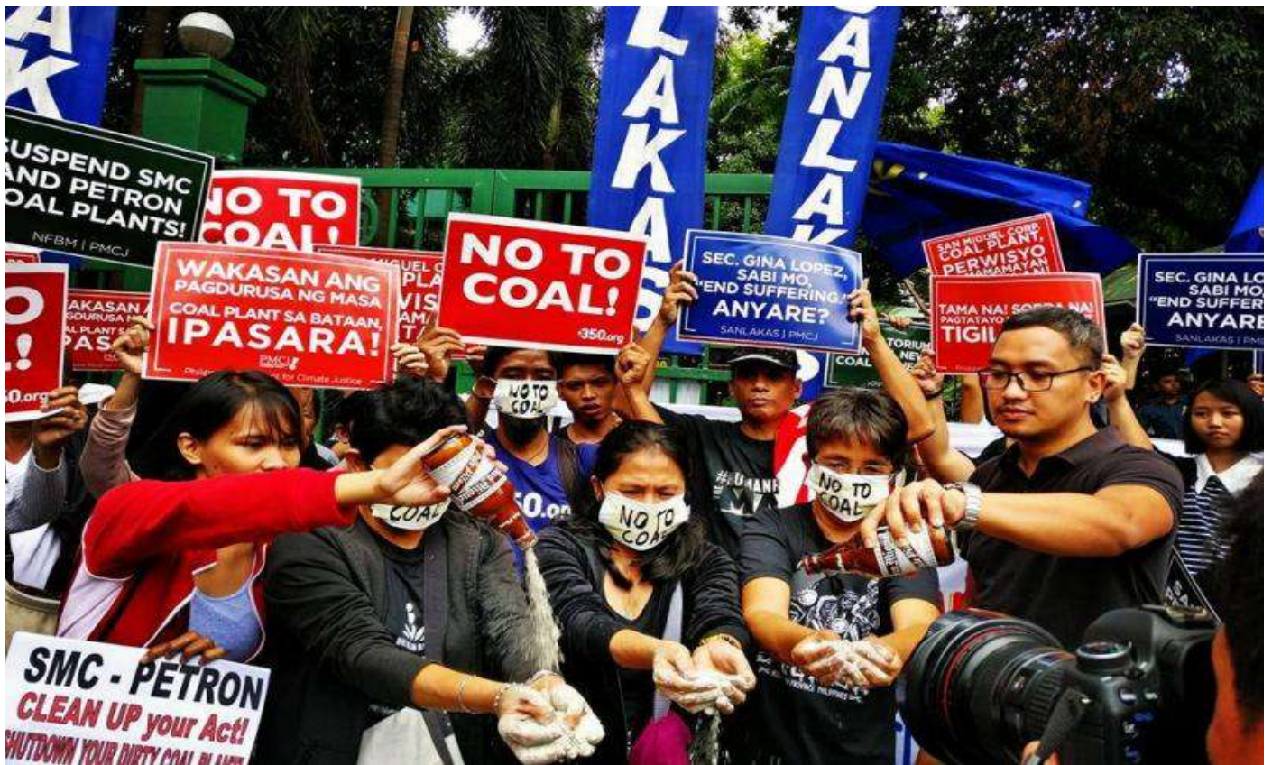
The IFC's financial intermediary lending has exposed the World Bank Group to coal projects around the world, including in the Philippines, where public opposition to new coal plants is strong.

financial-sector portfolio are systemic and run deep. A few years ago, the issue was not fully understood by the public, which knew of only a handful of cases in which IFC was exposed to companies that were causing harm to people or the environment through financial intermediaries.