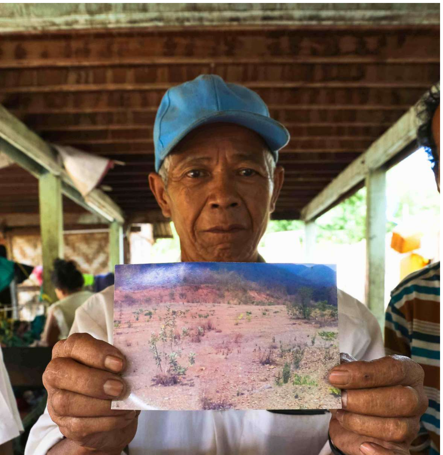
A villager showing a photo of what used to be his land that was bulldozed by Shwe Taung without warning or compensation.

When the IFC Board of Directors voted on the project in late July 2017, the US voted against it, referring to “significant concerns about the environmental due diligence”. Amongst its findings, it noted “gaps in baseline data for rare and endangered species as well as insufficient analysis and mitigation plans to address environmental impacts”, and expressed concerns about the lack of “emissions data for the coal mine and additional air quality data, without which it