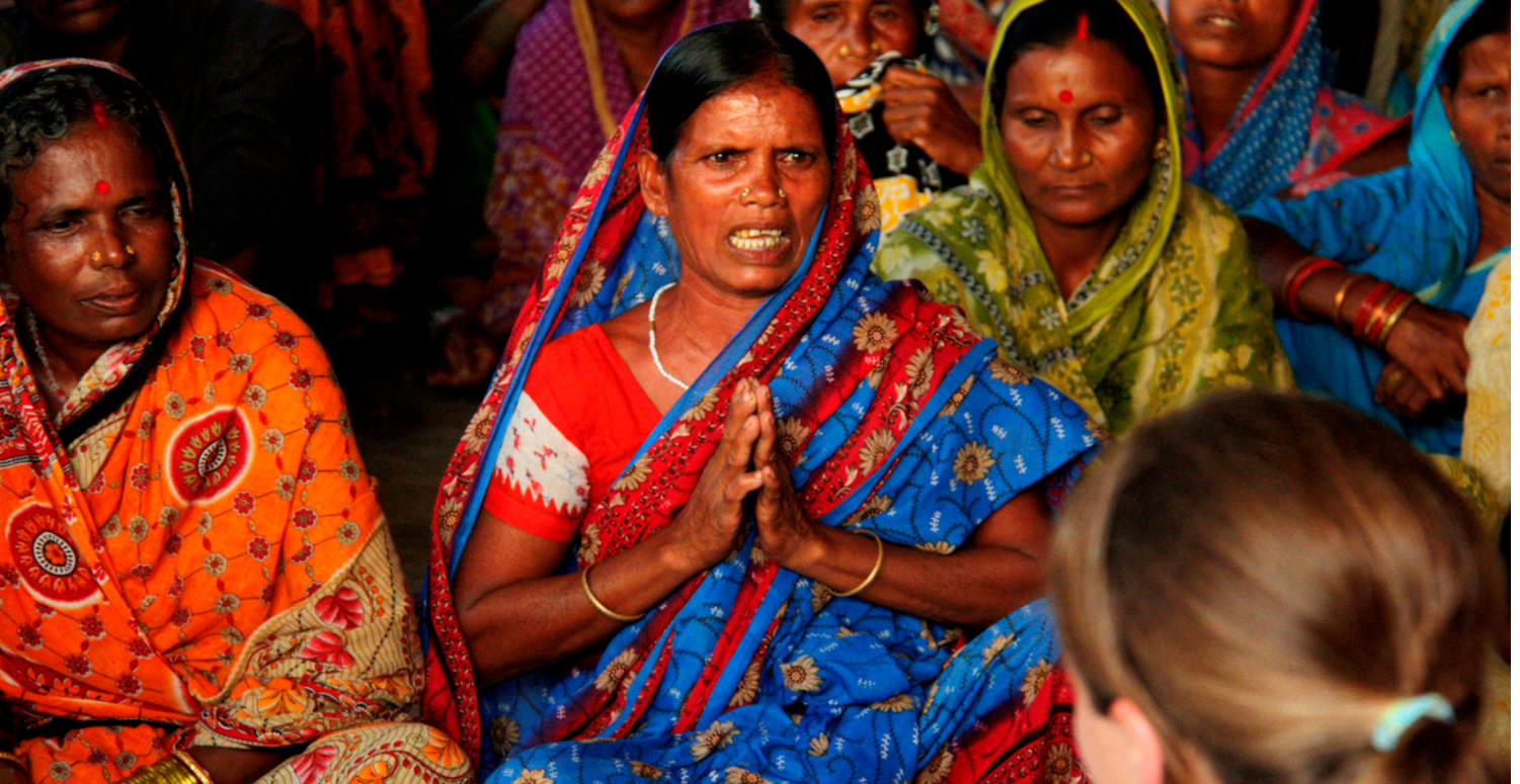
Women affected by the IFC-funded India Infrastructure Fund coal power project, GMR Kamalanga Energy.