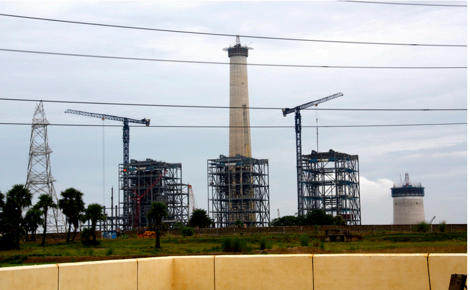
The GMR Kamalanga Energy coal power project in Odisha, funded by the IFC-backed India Infrastructure Fund.