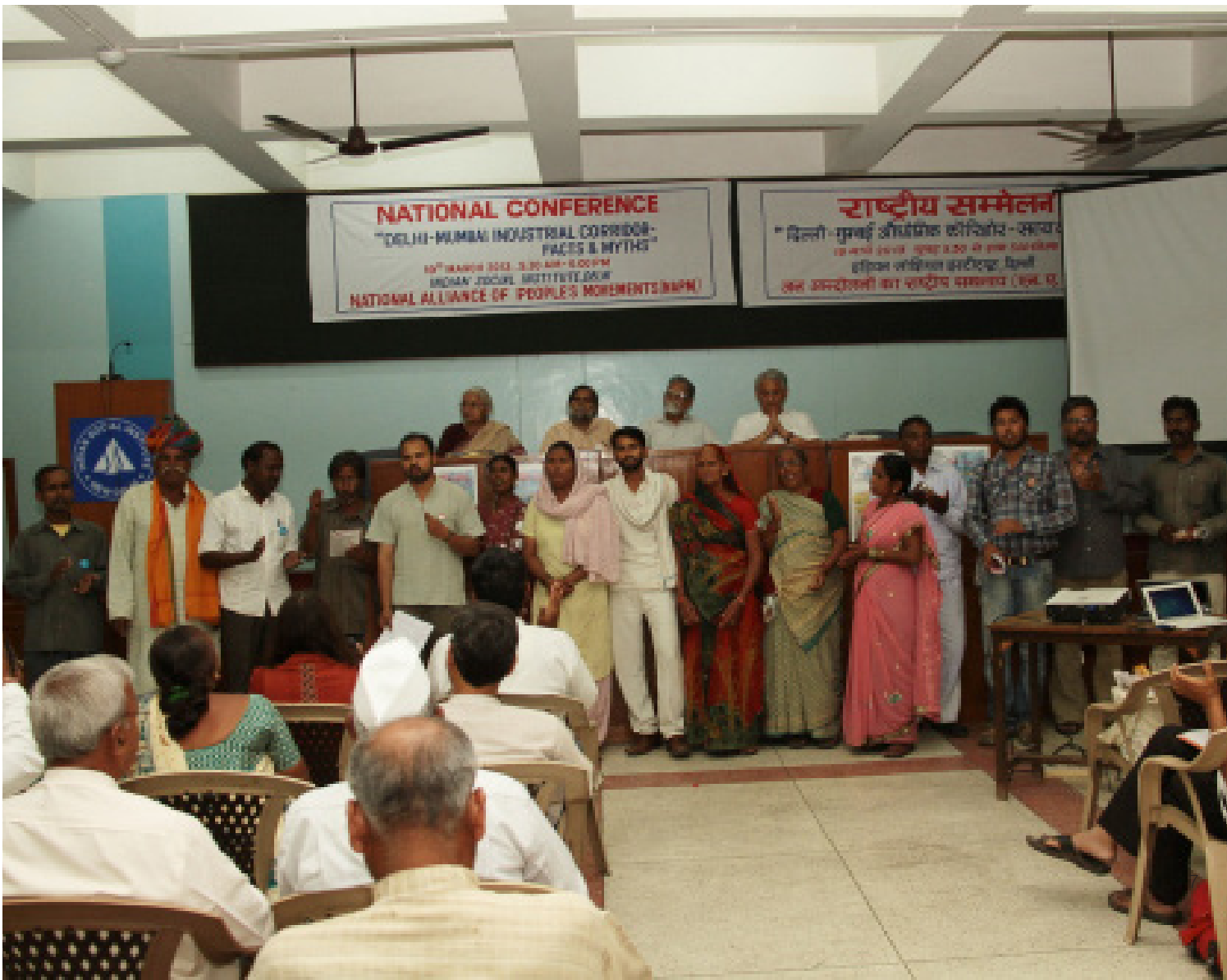
Activists meeting to discuss the Delhi Mumbai Industrial Corridor.

AIIB's Environmental and Social Framework (ESF) is not sufficiently robust in its disclosure requirements. For example, it does not commit to disclose documents a specific number of days before project approval, nor does it mention information disclosure relating to financial intermediary investments. The AIIB's draft Public Information Policy released for public consultation at the beginning of 2018, is also not reassuring. It does not specifically mention information disclosure in financial intermediary lending, despite this being a high risk investment activity. Furthermore, the draft policy puts in place restrictions which could presume against information disclosure by FIs, such as: "the Bank shall not disclose information, if doing so would prejudice the financial worth or competitiveness of a natural individual person or the Bank or any other corporate entity, or their assets." Nor does the draft policy commit to time bound disclosure of project