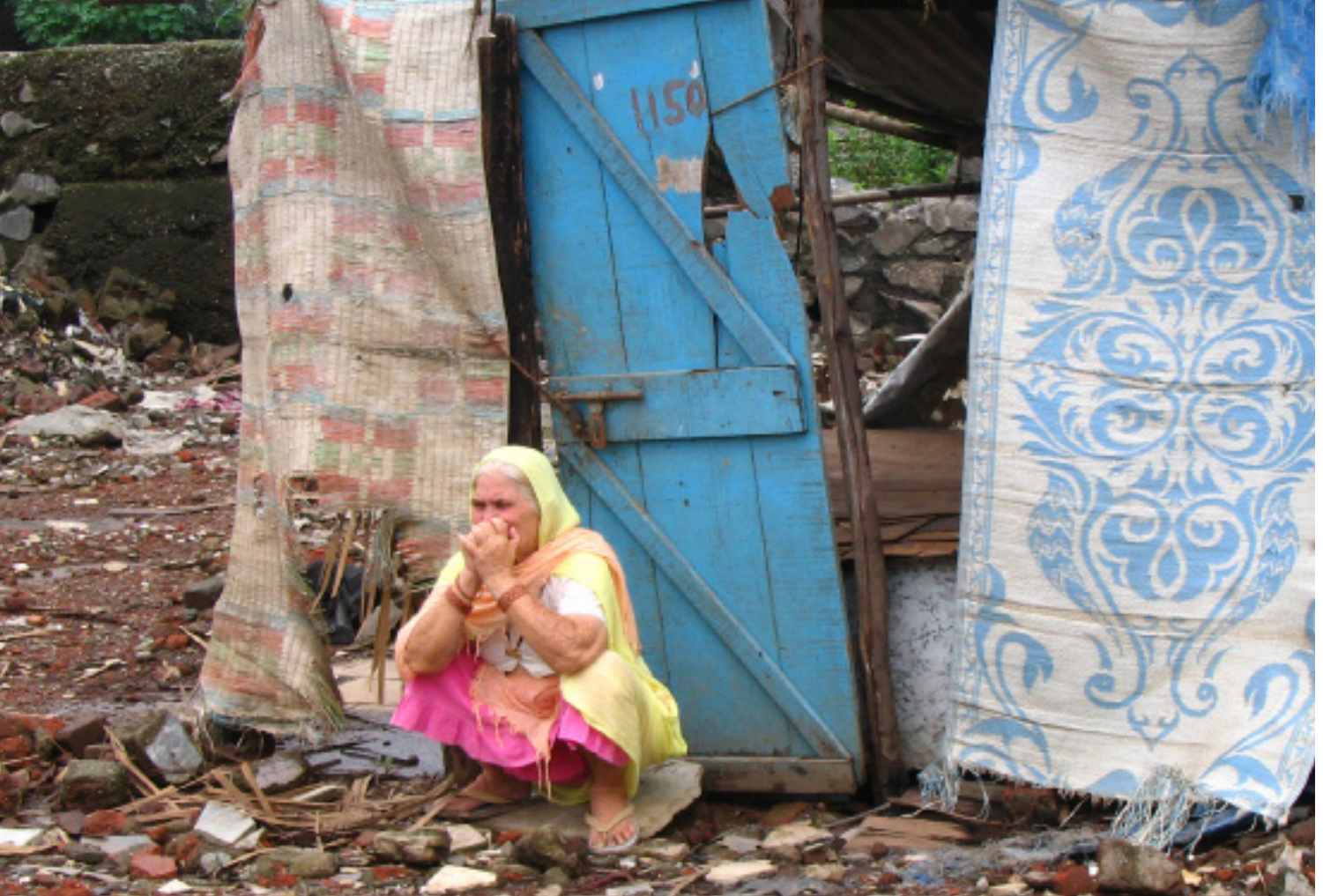
An old lady sitting dejected in front of the partly demolished structure which was once her home. Mumbai witnessed massive urban demolitions in the recent times, that has left many thousands homeless.

information - an essential step in ensuring information is available early enough in the project cycle for risks to be spotted and managed or averted.