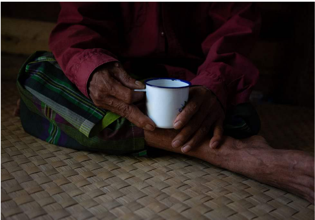
A community elder in Pemusiran village says he sees only the problems with the nearby coal mines and none of the benefits.

Coal dust plagues the villagers. It is stirred up from mining machinery, carried by the wind from stockpiles kilometers from the village and the overly full loads of the coal trucks. Consequently, even people who aren't employed in the mines have developed persistent coughs.