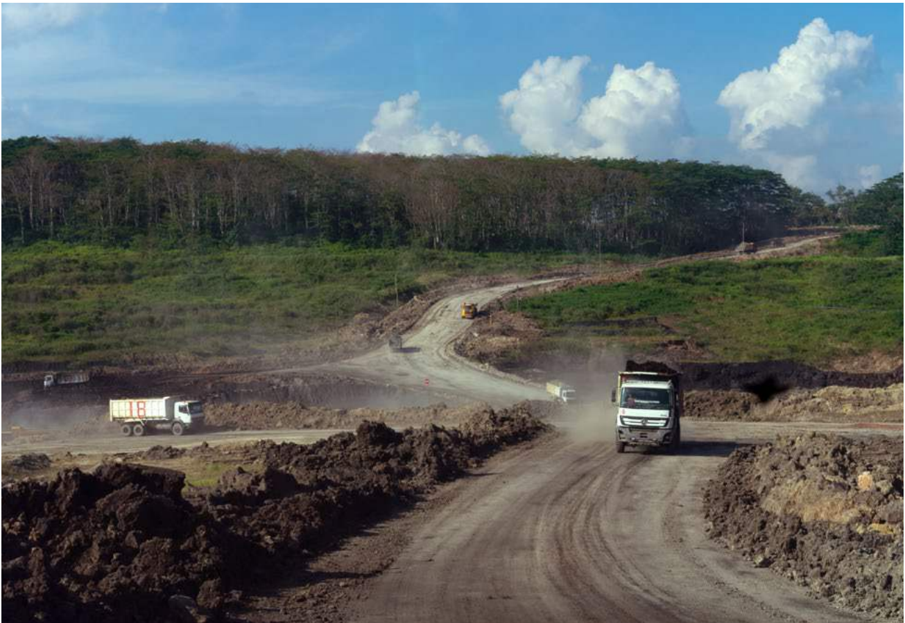
Coal development threatens the quality of life in Jambi, Indonesia.

The World Bank’s International Finance Corporation (IFC) has committed to no longer fund coal-related projects. However, an investigation by Inclusive Development International, Recourse and Trend Asia shows how the IFC continues to indirectly back some of Asia’s largest coal developers.