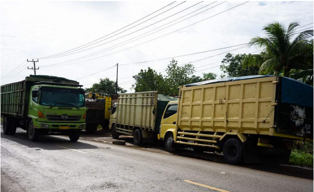
Coal trucks plague daily life in Jambi province.