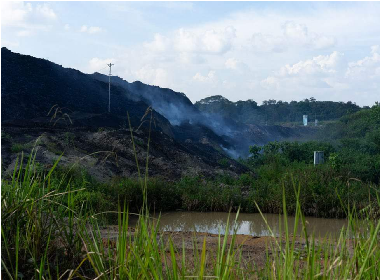
Coal dust causes respiratory problems for people living near coal mines in Jambi.

If Jambi 2 and other coal plants are built in Sumatra, coal mining will continue and likely intensify to fuel these plants.