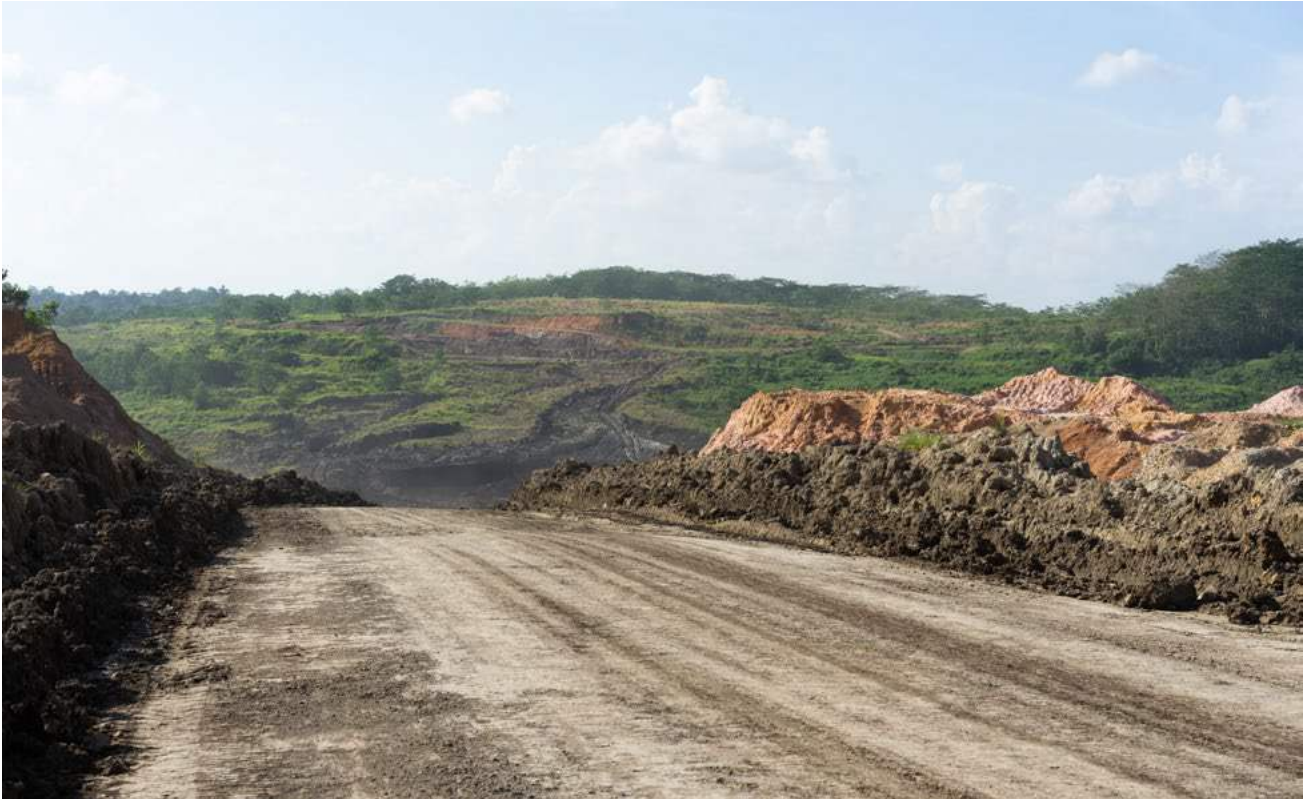
Three massive coal mines are located mere kilometers from the Pemusiran village.

Before the mines existed, water from the jungle-fringed river that winds through the town was clean enough for fishing, bathing and drinking. The mines have made that impossible. Locals allege that the mining companies dumped liquid waste into the water, which is now brown and murky. People who wash in the river have complained of health problems and itchy skin. Some of their children are sick and have skin flaking between their fingers and toes. Studies have found that children living near coal mines have increased risk of skin conditions.