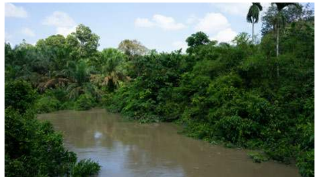
The Pemusiran River is brown and murky. Locals allege mining companies are dumping waste into the water.

Community members living in Pemusiran spoke to the authors of this report anonymously. Speaking out against the coal industry can have repercussions for people and their families who depend on the mines for their livelihoods.