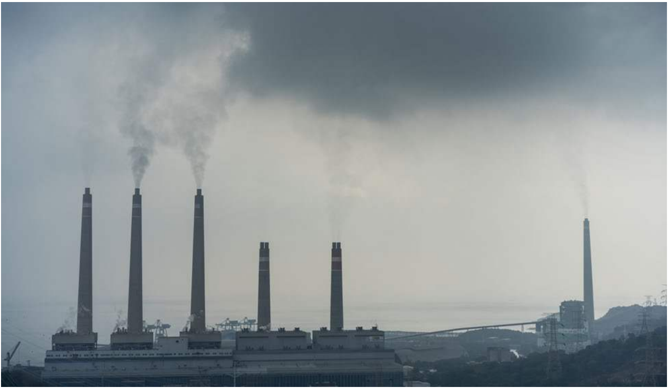
The chimneys of the Banten Suralaya power station blacken skies near Cilegon, Indonesia.