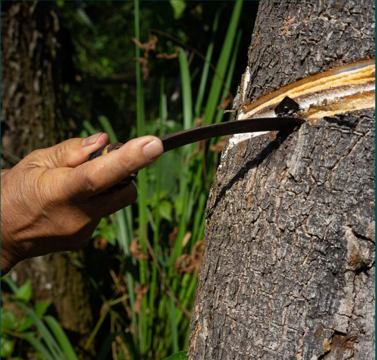
A rubber plantation worker believes coal development in the area is impacting the health of rubber trees.

Other farmers' livelihoods have also suffered. The removal of monkey habitats has driven the primates closer to town, causing problems for farmers who grow chilis, bananas, mangosteen and rambutan.