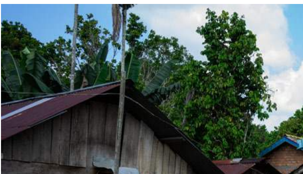
Pemusiran village is just a few kilometers away from three major coal mines.

Jambi 2 is planned in a region already plagued by the impacts of coal.